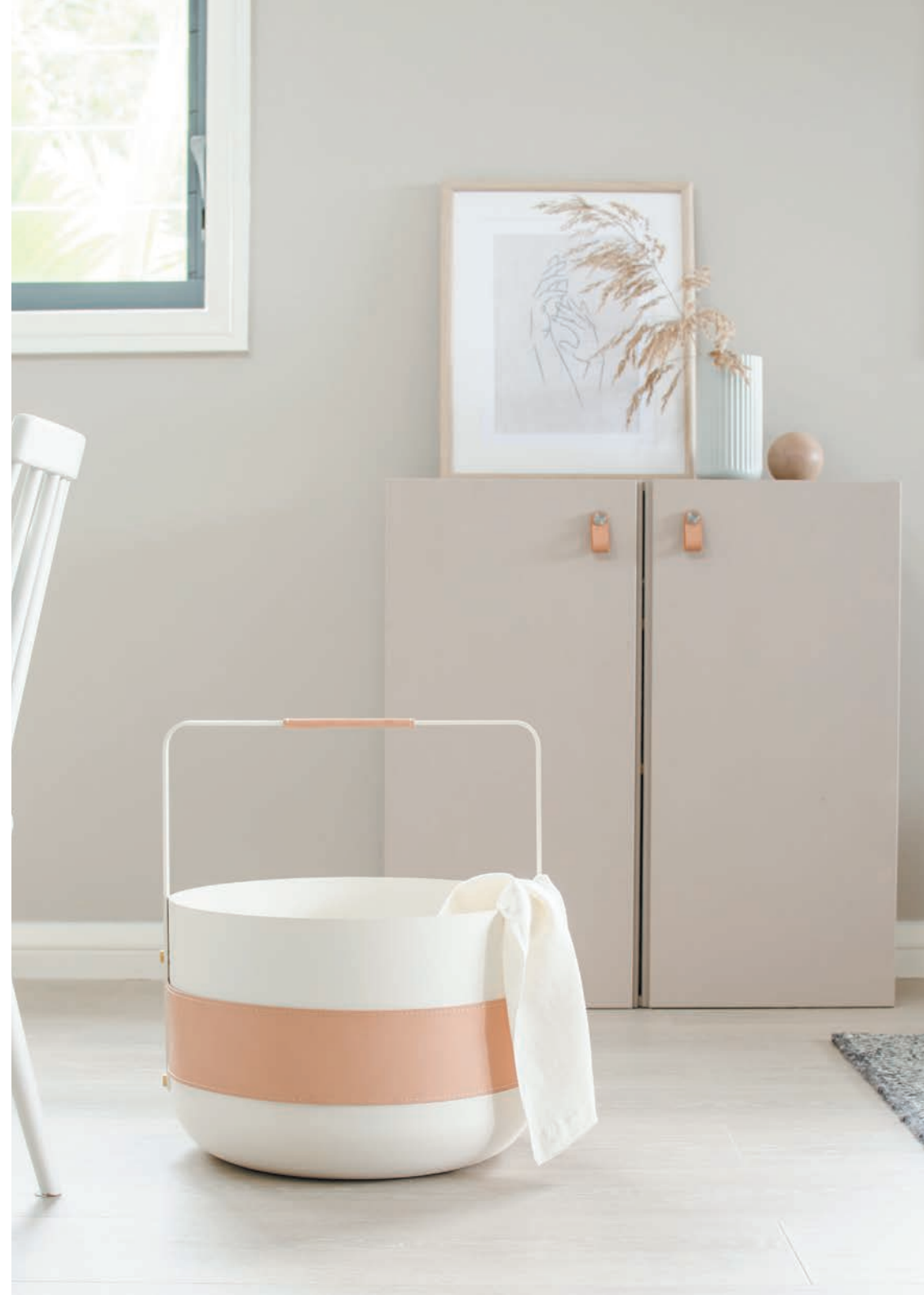
ON THE RIGHT: EMMA BASKET IN BLANC