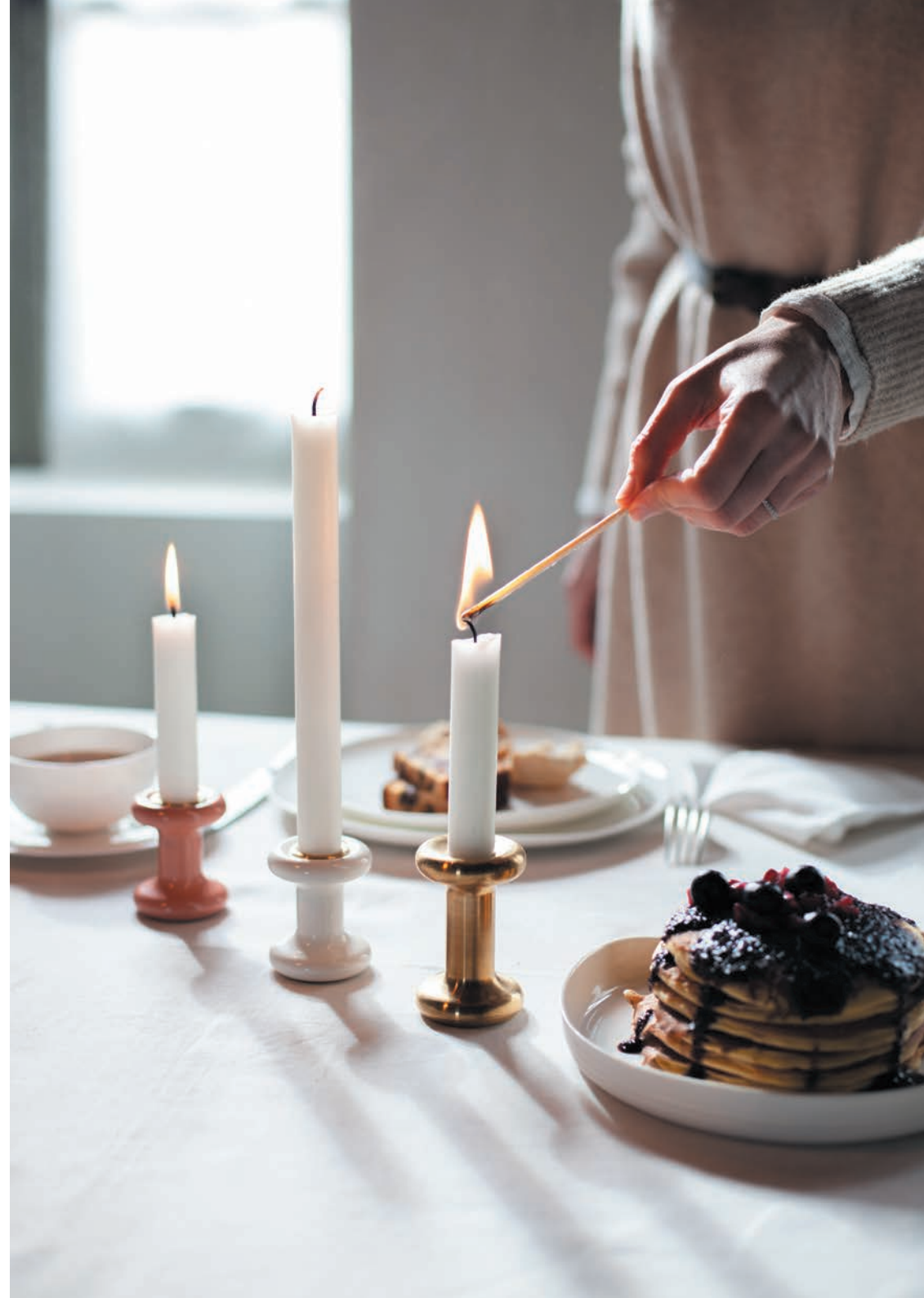
LUCIE CANDLE HOLDER IN BRASS 8CM