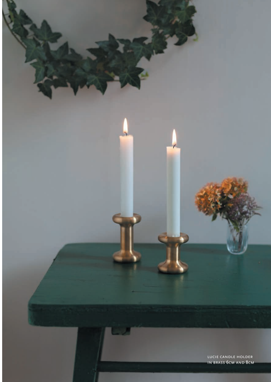
LUCIE CANDLE HOLDER IN BRASS 6CM AND 8CM

Please note that the materials shown here may vary slightly in appearance to the ones delivered, as they are natural products. Eldvarm continuously improves its products and reserves the right to change, without notice, the products and their features at any time. Eldvarm assumes no responsibility for any printed errors.