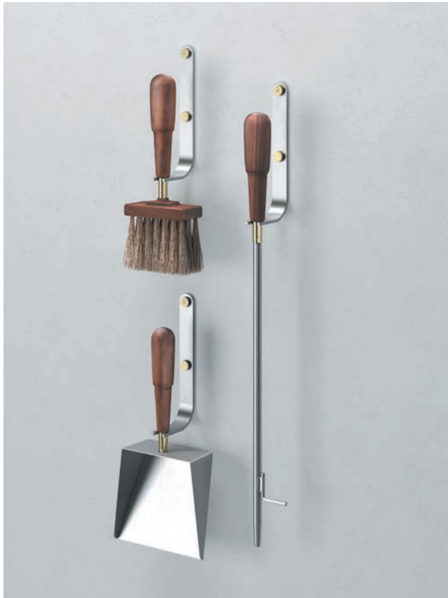
EMMA WALL SET IN LUMIÈRE

This is an alternative to our Emma Companion Set, where the tools can be hung on the wall. The set contains three hooks, along with matching blow poker, shovel and brush. Each set is beautiful and highly functional, with the choice to either discreetly store or proudly display your tools.