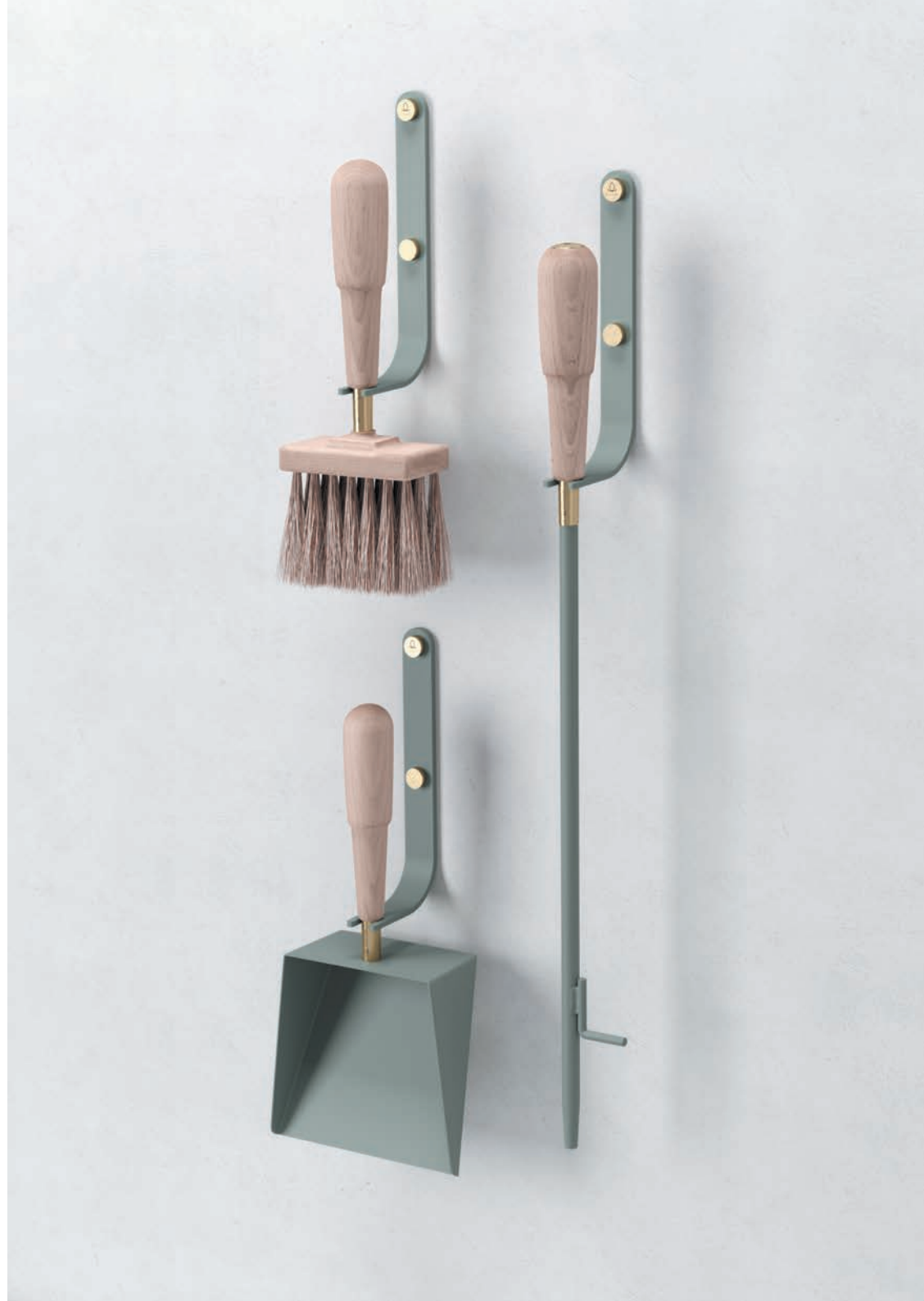
ON THE RIGHT: EMMA WALL SET IN LICHEN