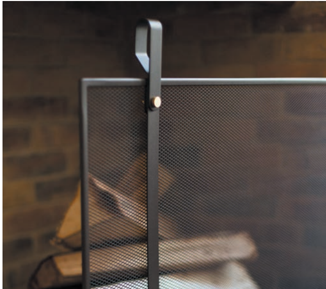
EMMA FIRESCREEN IN CLASSIQUE

We were also mindful that a fireplace isn't always lit, so we designed a screen that is beautiful without demanding attention, with or without a fire flickering behind it. When the fireplace is empty, it adds charm to a room with its elegant curves and very Scandinavian design expression.