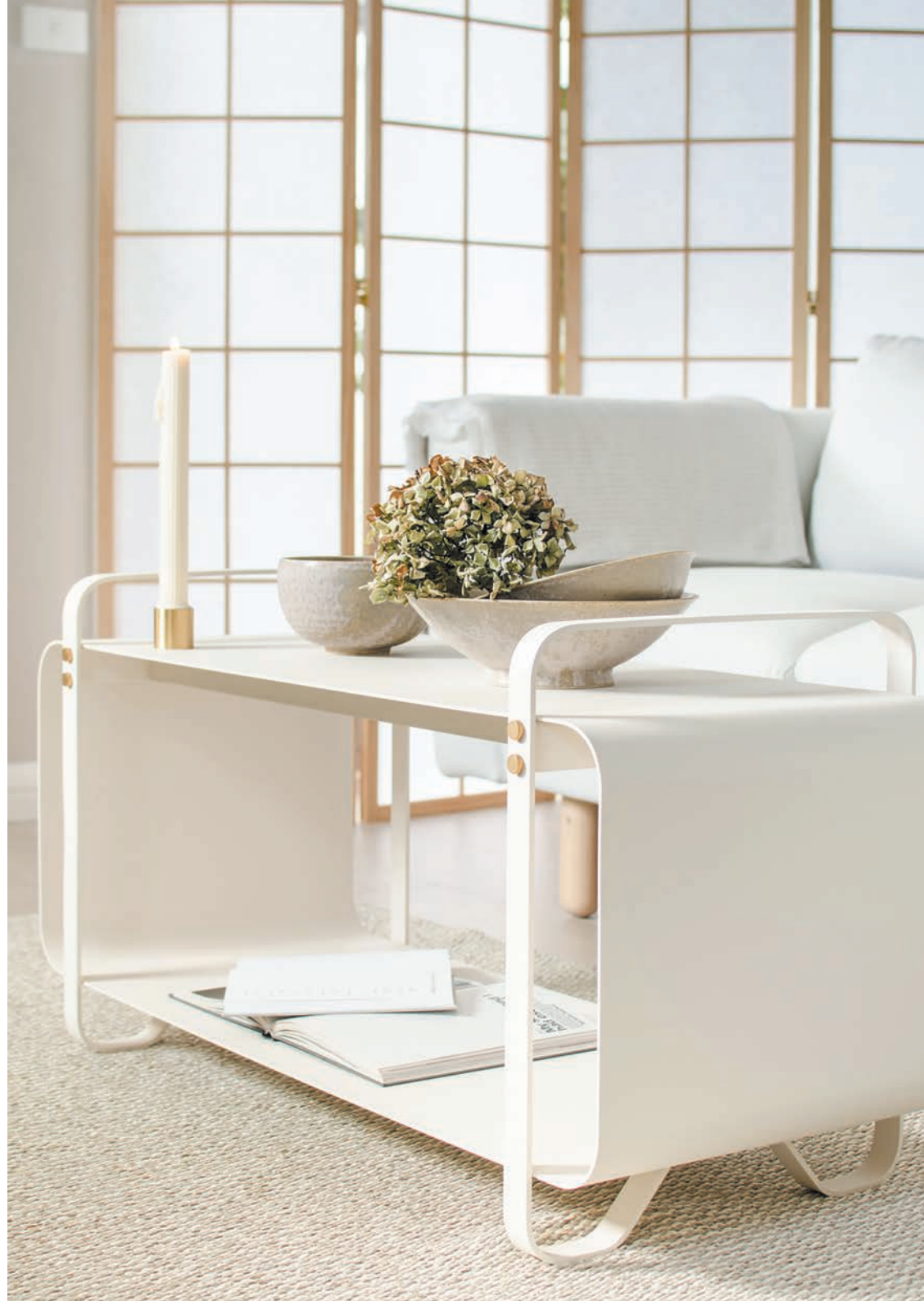
ON THE RIGHT: NINNE BENCH IN BLANC