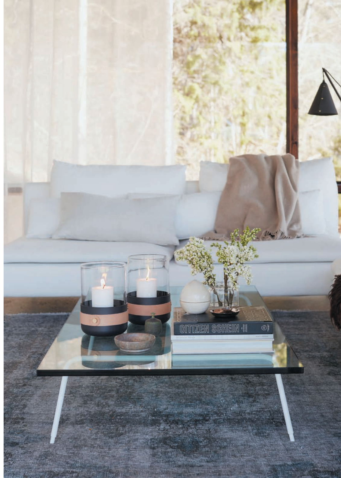
ON THE RIGHT: EMMA LANTERN IN NATUREL