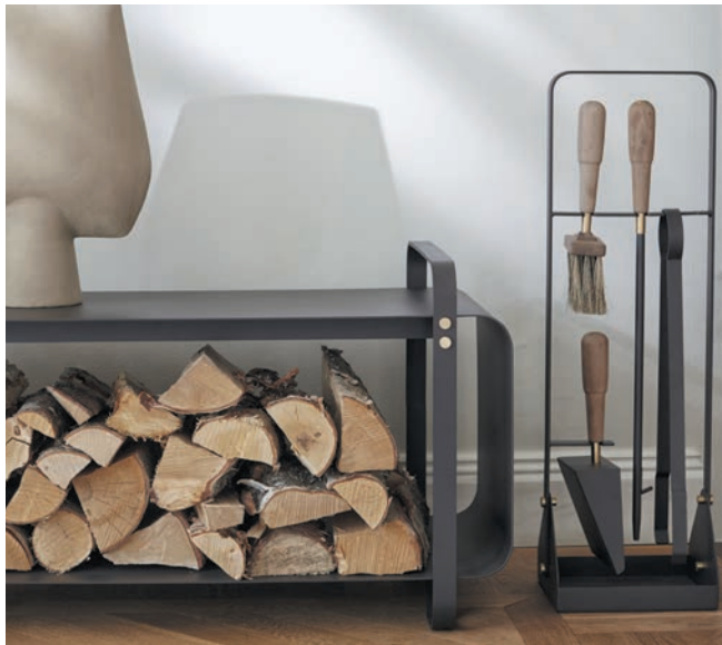
NINNE BENCH IN CLASSIQUE

The Ninne Bench is also available for outdoor usage. The steel on the outdoor version used has been galvanised so it can withstand the harshest of climates.