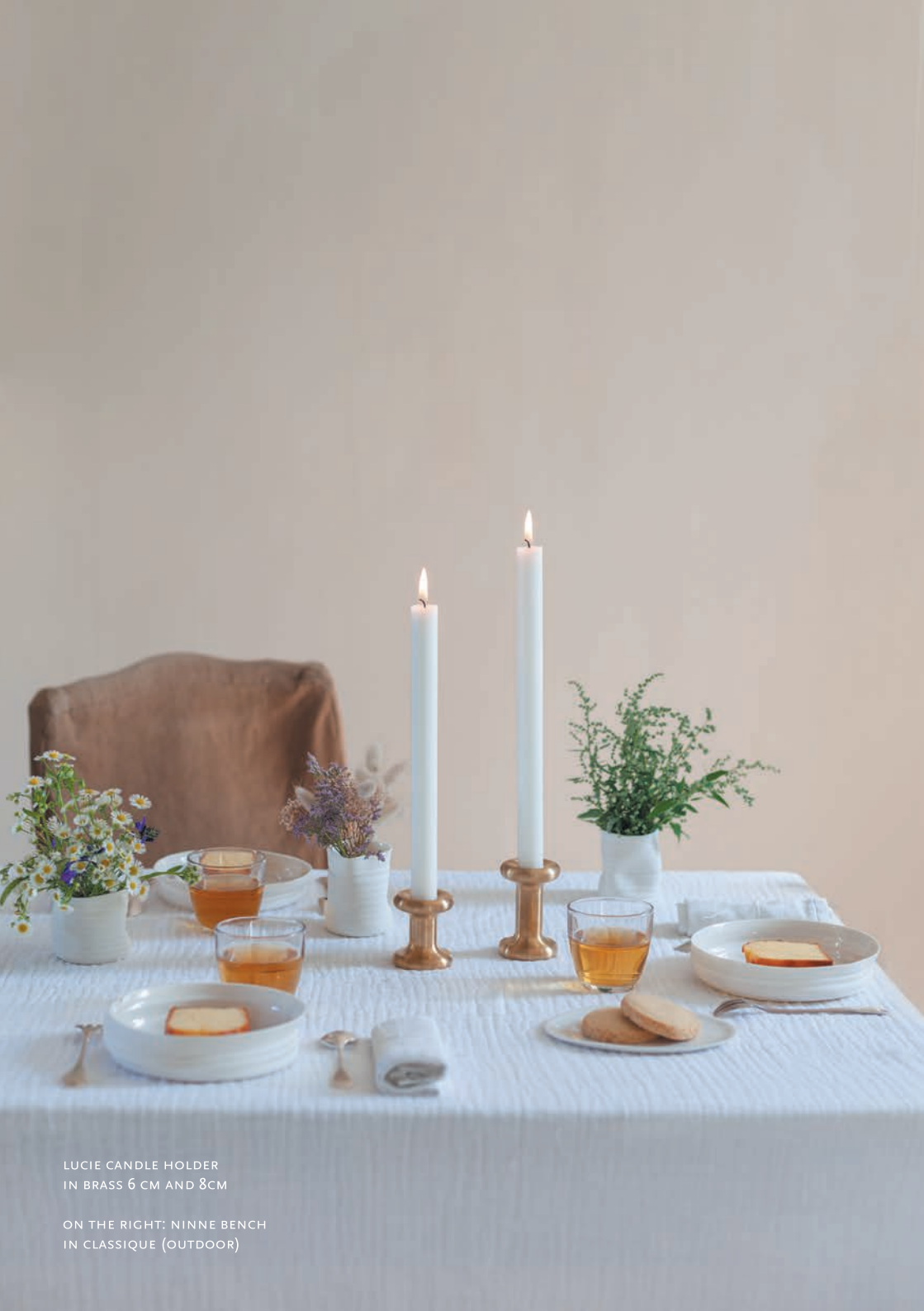
LUCIE CANDLE HOLDER IN BRASS 6 CM AND 8 CM

These are the values that run through our design and company. We find inspiration in nature and its beauty, and we try our best to respect it throughout our production process.