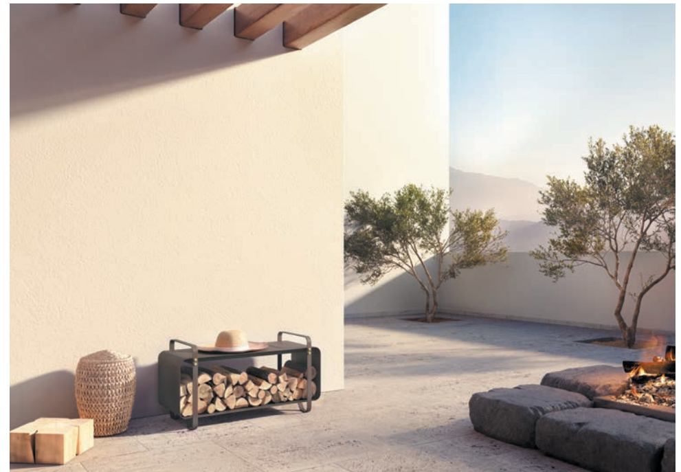
ON THE RIGHT: NINNE BENCH IN CLASSIQUE (OUTDOOR)