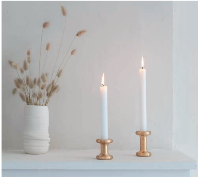
LUCIE CANDLE HOLDER IN BRASS 6CM AND 8CM

The Lucie candle holder is small in size, but is surprisingly heavy due to the solid metal. Lucie adds a decorative touch to a mantelpiece or table setting, with or without a candle. We love to mix and match the sizes and colours for a playful effect.