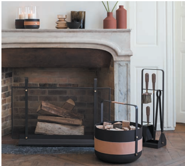
EMMA LANTERN IN HAVANE AND IN NATUREL

The basket is designed for stylish firewood storage but is truly multi-purpose. The basket can be used to store anything in your home – towels, magazines, toys, even plants. When it comes to storing wood, the straight side lines allow you to fill the basket with more logs than you might imagine and the solid design means that all of the small bits of bark remain inside.