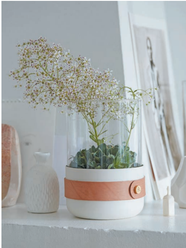
EMMA LANTERN IN BLANC

The Emma Lantern is the Emma Basket's little sister. It's the same shape and just as versatile. Although it was designed to be used with a candle, our lantern can also be used as a flower or plant pot or a small bowl if you remove the glass. We love to mix and match the colours.